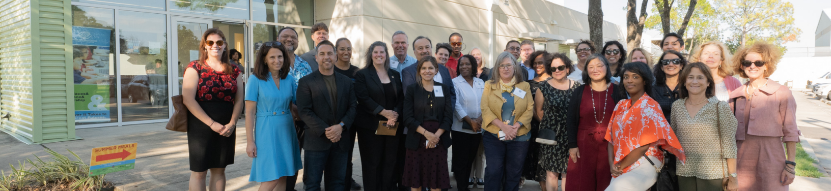
The Coordinating Council on Juvenile Justice and Delinquency Prevention in Houston, September 2023.

community-based services for justice-involved youth. Civic Heart Community Services, which serves as an intermediary organization for the fund, interacts directly with impacted communities and selects local grantee organizations to fill service gaps in areas of greatest need.