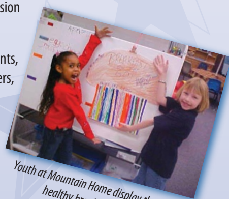
Youth at Mountain Home display their 4-H healthy breakfast project