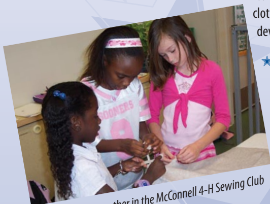
Friends work together in the McConnell 4-H Sewing Club

This accomplishment list represents only a small portion of the 4-H/Air Force activities that are offered by caring Youth Programs and 4-H staff that have provided positive learning experiences for youth. Other wonderful 4-H success stories are taking place at an Air Force base near you right now. Visit your local Extension office to find out what you can do in 4-H!