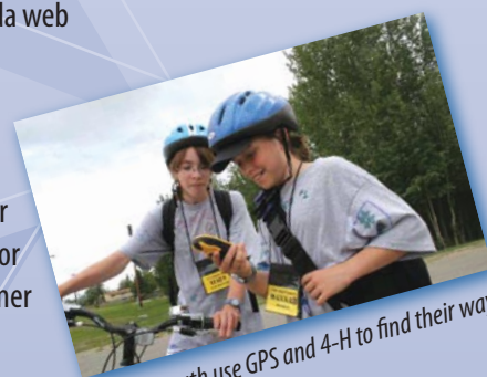
Eielson youth use GPS and 4-H to find their way