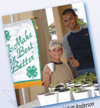
4-H transplant project at Anderson

4-H Clubs continue to grow on Air Force bases around the world! Currently, there are more than 6,100 Air Force youth enrolled in 4-H in a variety of clubs. Each base is required to run three 4-H clubs with one of the clubs' focus in the area of Health, Nutrition and Fitness. The AF FitFactor program ties in well with a healthy cooking class or 4-H Fitness club. The 4-H experience on each base includes a variety of club options that range from animal care to woodworking; photography to embryology; sewing to gardening; and GPS geo caching to robotics. This report represents only a small sample of the 4-H programming on Air Force bases.