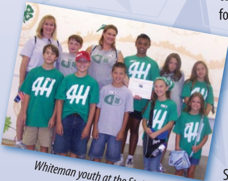
Whiteman youth at the State Fair