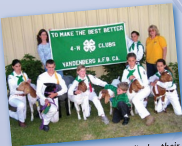
Vandenberg 4-Hers proudly display their award winning goats at the County Fair