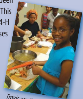
Travis youth mix Healthy Cooking and 4-H fun