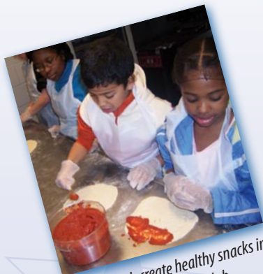
Tinker youth create healthy snacks in the 4-H cooking club

★ Tyndall AFB, FL —Teens have taken an active leadership role in Lock-ins, Junior Congress, and 4-H District Council meetings. Teens designed two 4-H/Military patches for Bay County and the 4-H booth for the North Florida Fair. In addition, Tyndall 4-H'ers completed Counselors in Training course and served as junior counselors during the 4-H county camp.