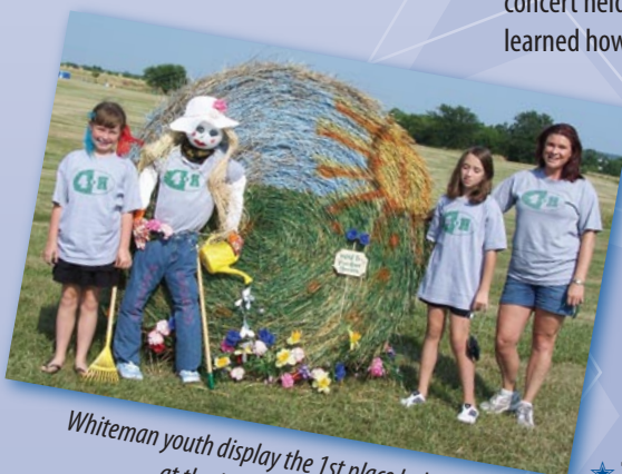
Whiteman youth display the 1st place bale of hay at the Johnson County Fair