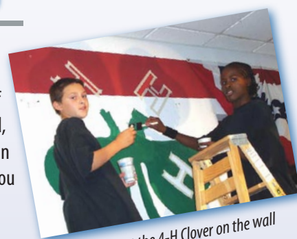
Youth paint the 4-H Clover on the wall at the Pope youth center

Due to the dedication and commitment of these states, National 4-H Headquarters, CSREES, USDA, and Air Force Services Family Member Programs, military youth overseas are able to enjoy a taste of home through 4-H clubs on Air Force bases.