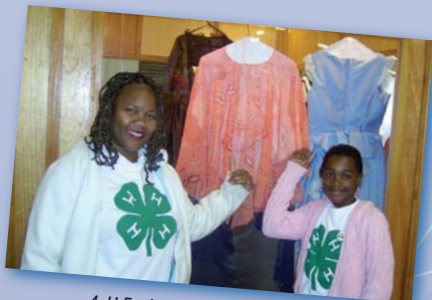
4-H Fashion review at MacDill