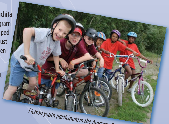
Eielson youth participate in the Amazing Race

★ McConnell AFB, KS —First year that the School Age Program had 4-H projects entered in the Sedgwick County fair. Youth were proud to be recognized and awarded ribbons! All of the members visited the fair and enjoyed seeing the exhibits, but were even more thrilled to see their own entry receive a ribbon!